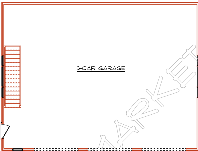
LEVEL ONE PLAN